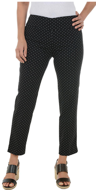
Polka Dot Pull-On Ankle Pant

Black and red is a classic combination that attracts the right kind of attention. In this Valentine's Day dinner outfit, you'll look and feel elegant, cute, and maybe a little daring, too!