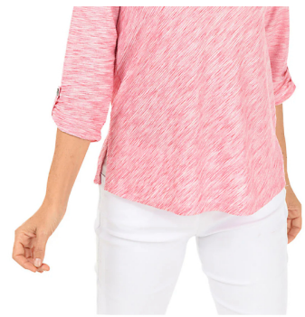
Diagonal Rib Knit Top