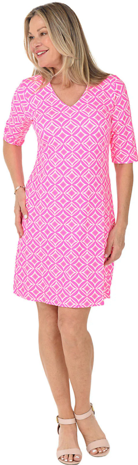
Mod Geo V-Neck UPF50+ Dress

Is wearing pink on February 14 a little on the nose? Maybe, but isn’t the whole holiday? So have fun and by all mean means, wear a color that makes you feel pretty! Mix and match these pink staples to your liking for an outfit that’s true to you.