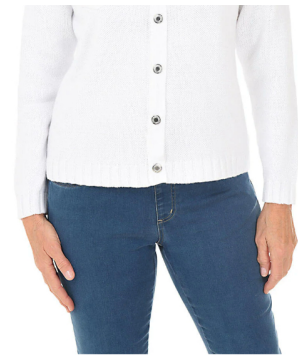
Button-Front Denim Sweater Jacket